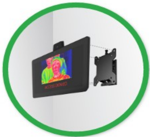
TTS panel shown with optional WMT-1 wall mount