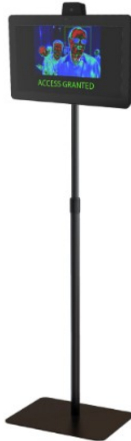
TTS panel shown with optional APS-1 pole stand